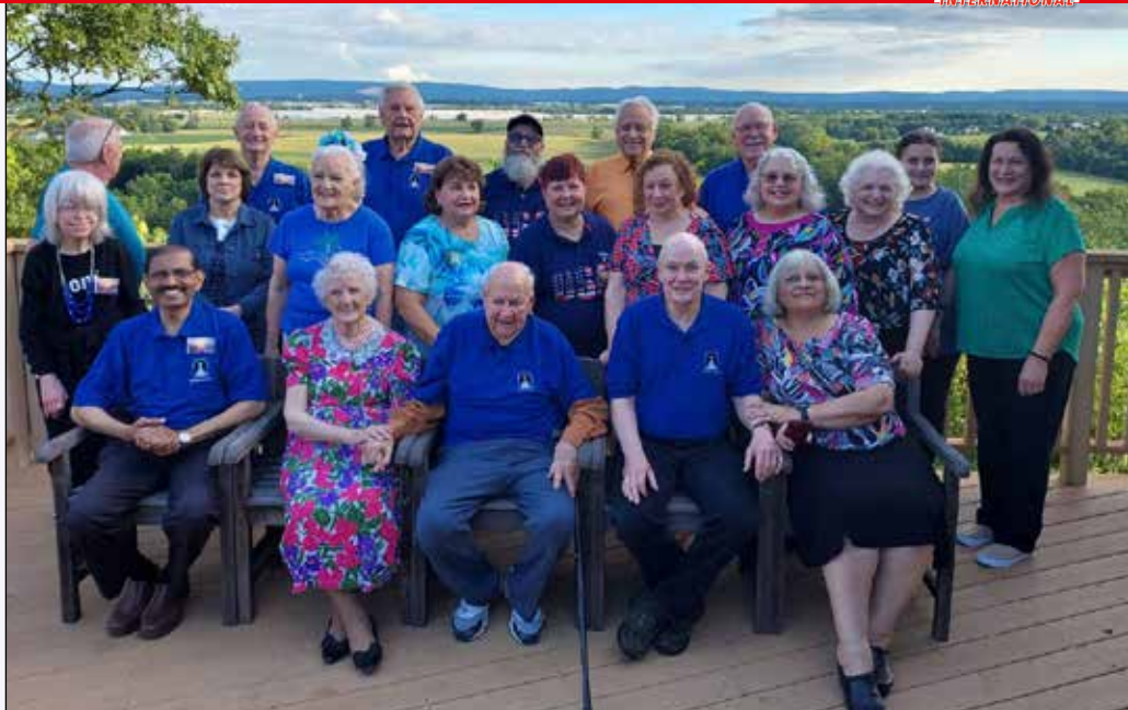
▲ August 2023: 82nd National RailHope America Convention in Carlisle (PA), USA

RailHope America takes the opportunity to develop a suitable RailHope Calendar 2025 for the USA. The expertise and design of RailHope International can also be utilised for this calendar project.