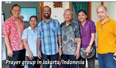
Prayer group in Jakarta/Indonesia

RailHope Singapore will take the patronage for RailHope Indonesia. This includes continuing to accompany and, if neces-