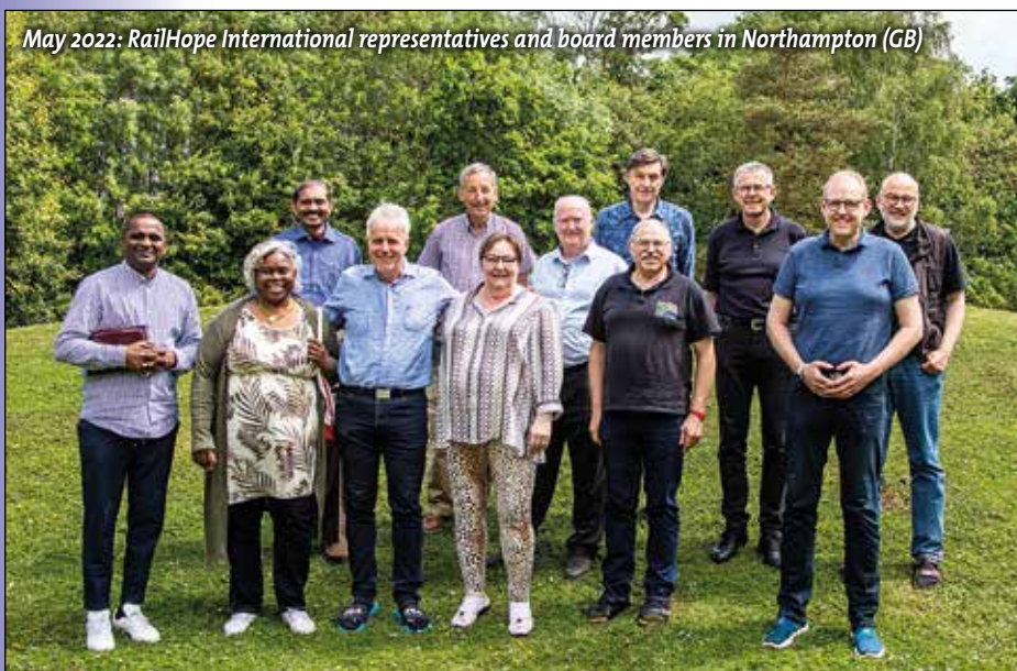
May 2022: RailHope International representatives and board members in Northampton (GB)

In 2019, the idea was born in Lunteren (NL) that RailHope Germany, Austria and Switzerland (DACH) would in future publish their national association magazines together three times a year. Feedback suggests that an attractive design with inspiring content contributes significantly to being perceived as part of the media diversity in the world of railways and public transport. We hope that this positive